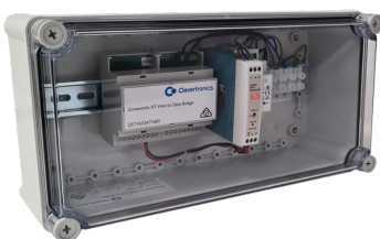
Zoneworks Data Bridge